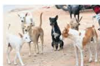
Stray dogs roaming on a street in Coimbatore district | FILE PICTURE

According to the Directorate of Public Health and Preventive Medicine data accessed by TNIE, of the 43 rabies deaths recorded in 2024, 41 were due to partial or complete lack of vaccination, and two persons died