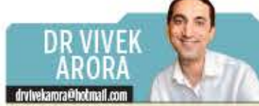
The expert is a senior veterinarian, Crown Vet, Delhi.

Experience the Madras revival at The Leather Bar & Pasha, THE Park Chennai. The chefs and bartenders have come together to craft a menu where classic Madras snacks with a contemporary twist, while cocktails are inspired by its legendary landmarks — each glass brimming with the city's character, charm, and spirit. WHEN: Till August 30