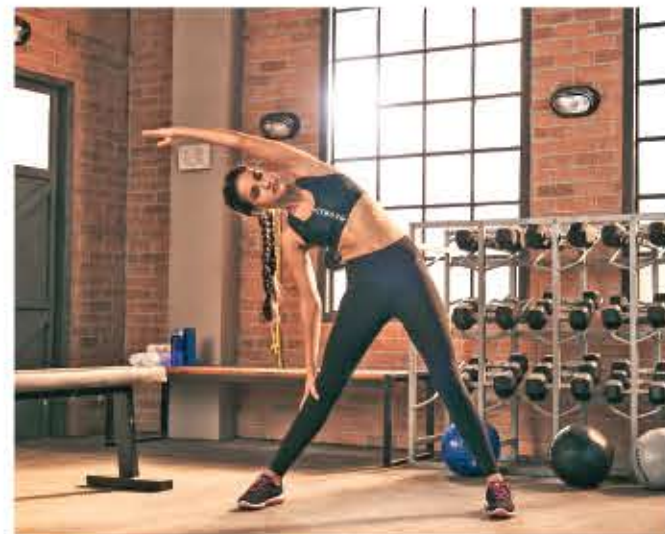
By Abhishek K, fitness expert, cult — a fitness and wellness platform

Next time you're tempted to skip it, remember, warm-up isn't wasted time, it is what makes everything else flow better.