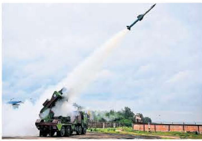
DRDO conducts maiden flight-tests of Integrated Air Defence Weapon System | P11

"During the flight-tests, three different targets including two high-speed fixed-wing unmanned aerial vehicle targets and a multi-copter drone were simultaneously engaged and destroyed completely by the QRSAM, VSHORADS and High Energy Laser weapon system