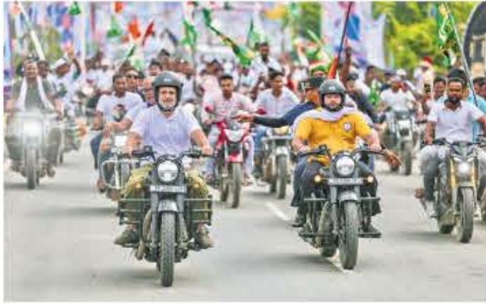
LOP Jokes about his marriage, says 'talks on'

Rahul also accused the BJP-RSS of "closing the doors of opportunity" for Dalits, backward classes, women and the poor, and of attempting to "destroy the Constitution."