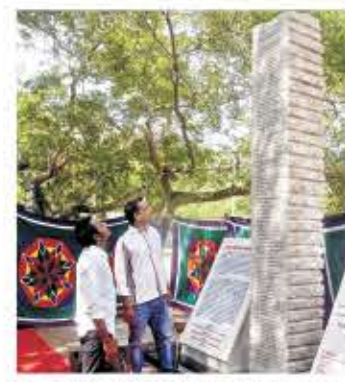
The 3-metre-tall stone on which the 11 Cambridge Rules of Football have been inscribed in Tamil | MARTIN LOUIS

divided into nine segments, each bearing the rules in different languages. Of the nine, four segments were installed at Parker's Piece. Five were sent across the world - to Brazil's Maracana Stadium, Shanghai Shenhua FC's training ground in China, the Maadi Olympic Centre in Egypt, and Glads House adjacent to Bomu Community Stadium in Kenya, each having rules engraved in their respective language. The fifth stone sent to India, with rules carved on it in Tamil, has now found its home at the YMCA College of Physical Education