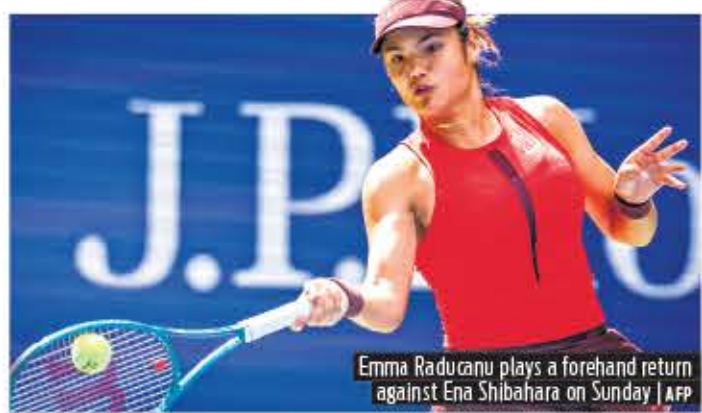
Emma Raducanu plays a forehand return against Ena Shibahara on Sunday