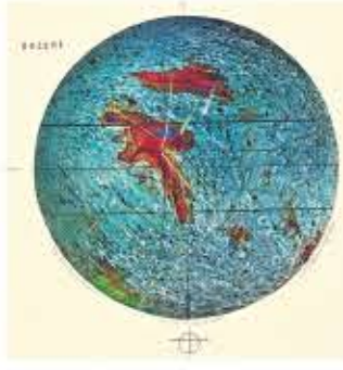
RM PALANIAPPAN, Artist

According to NASA, the Voyagers are the first to pass through the heliosheath, which exists somewhere from eight to 14 billion miles from the Sun