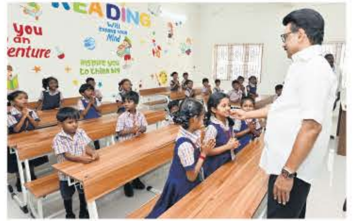
Chief Minister M K Stalin interacting with schoolchildren | FILE PICTURE