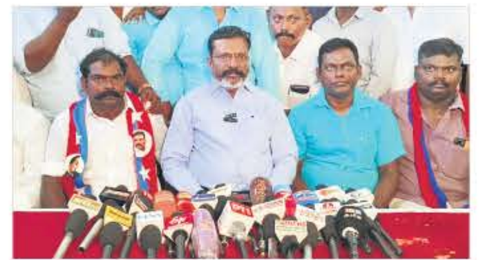
VCK president Thol Thirumavalavan talking to reporters in Thoothukudi

Dismissing speculation of friction between the BJP and the AIADMK, Nagenthran said that the BJP is a national party with over 1,200 MLAs and 330 MPs. "Those claiming that the AIADMK-BJP alliance is incompatible should first say how many MPs or MLAs they have. Ours is a strong alliance," he added.