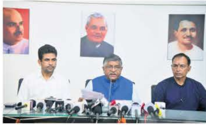
Bihar SIR: ECI says docus of 98% electors received

He also cited the case of Maharashtra, where Congress won 13 seats, BJP and Shiv Sena 9 each, and NCP 8. "Was not the same Election Commission there too?" he asked. He added that Congress also formed governments in Himachal Pradesh and Telangana, asking whether the EC was only valid when the Congress won. Prasad said, "If the people do not vote for Rahul Gandhi, what can anyone do? In Haryana, Delhi, and Maharashtra assembly elections, BJP won because the people saw through his lies." He accused