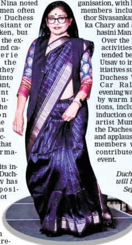
Duchess Utsav will be held on September 1 and 2 at Hotel Savera from 10 am to 8 pm.

Over the years, its activities have extended beyond the Utsav to include initiatives such as the Duchess Women's Car Rally. The evening was marked by warm introductions, including the induction of makeup artist Mumtaz into the Duchess "tribe" and applause for new members who had contributed to the event.