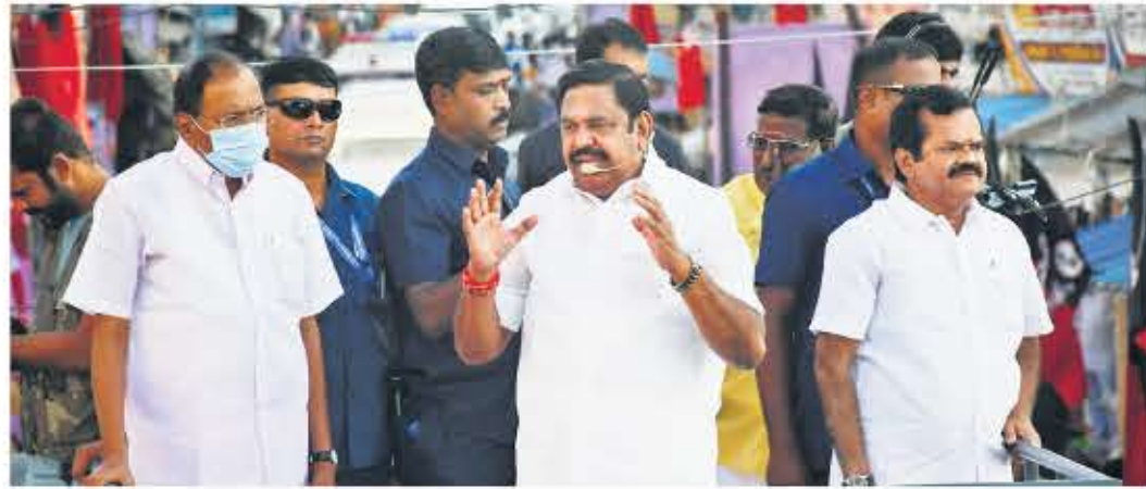
AIADMK general secretary Edappadi K Palaniswami addressing a campaign in Manachanallur near Tiruchy on Sunday