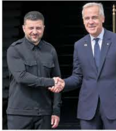
Canadian Prime Minister Mark Carney, right, shakes hands with Ukrainian President Volodymyr Zelenskyy during their meeting in Kyiv, Ukraine

its air defenses intercepted 95 Ukrainian drones over Russian territory overnight into Sunday.