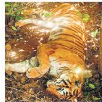
The tigress fell ill on Sunday afternoon and died in the evening

"We began monitoring the animal's movement around the clock since it was spotted near