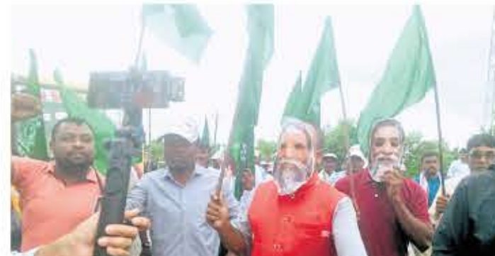
Police resorted to mild force and fired teargas shells to disperse farmers protesting against land acquisition for the construction of a medical college | EXPRESS

"Prohibitory orders have been imposed in the entire area. When the crowd became uncontrolled and tried to create