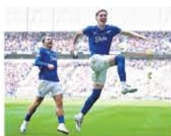
Everton's James Garner celebrates after scoring the second goal on Sunday

Rodrigo Muniz's own-goal put United in front, but Emile Smith Rowe came off the bench to rescue a point for Fulham. Results: Fulham 1-1 Man Utd; Everton 2-0 Brighton; Palace 1-1 Forest.