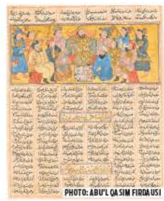
PHOTO: ABUL QASIM FIRDAUSI

Bozorgmehr, the youngest and wisest of Khosrow's ministers, approached the chessboard and, after some deliberation, declared he understood the game. In essence, Bozorgmehr reconstructed the rules of Chaturanga without ever having seen it played. Having deciphered the