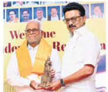
Chief Minister MK Stalin presents a bronze statue of Thiruvalluvar to V-P candidate Sudershan Reddy in Chennai | EXPRESS

Environmentalists say the block where the 20 exploratory wells are proposed is close to ecologically-sensitive areas like Gulf of Mannar Marine National Park and several notified bird sanctuaries. The environmental clearance has also raised questions over transparency. P4