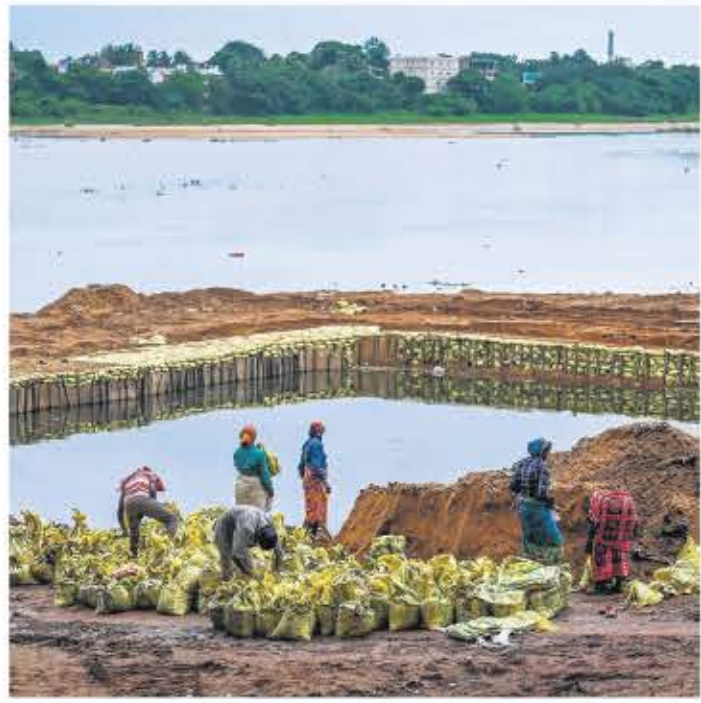
Ahead of the festival season, city authorities set up a temporary pond for idol immersion on the banks of the Kuakhai River in Bhuvanagar on Sunday

The data also showed that dog bite cases are on the rise in the state. While 4.81 lakh cases were reported in 2024, 3.83 lakh cases (80% of last year's) have already been recorded in the first eight months of 2025. Meanwhile, human rabies deaths seem to show signs of marginal decline as per the numbers reported so far. A