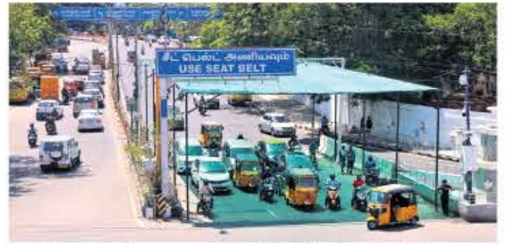
The shade pavilion that was set up at Quid-e-Millath Government College junction road in Anna Salai at Chennai recently

Activists expressed concerns that installing sun shades just two months before the monsoon would potentially be a waste of taxpayers' money. Since the new structures are