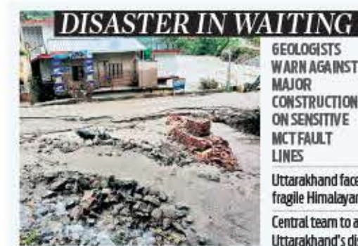
Gad debris blocked the Bhagirathi River between Dharali and Harsil.

Recent disasters like the Bhatwari land submergence and the formation of a lake in the Yamuna River at Syana Chatti due to debris from Kupda Khadd have been linked to MCT activity. Similar phenomena were seen earlier when Tail