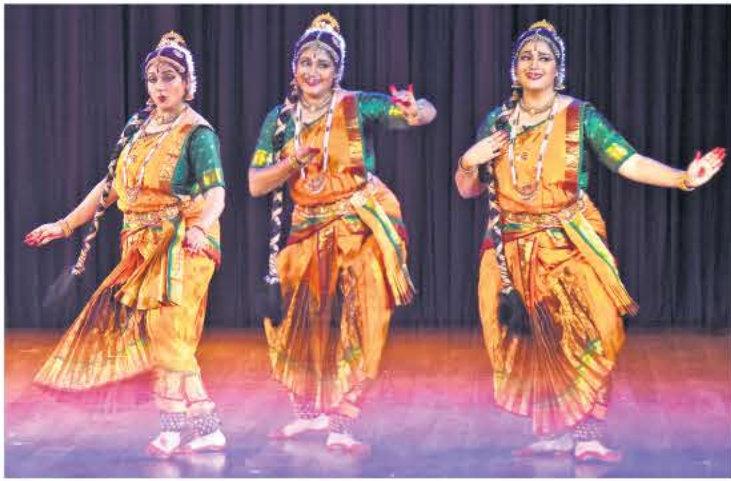
FRAMES OF ELEGANCE